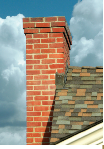
popular, becoming the preferred choice today among builders. architects and interior designers.

in a home or office is a masonry fireplace. The warmth of a fire can bring life, energy and charm to any room. Adding a masonry fireplace can add an old world ambiance reminding us of a bygone era. But it's also contemporary as masonry fireplaces are increasingly